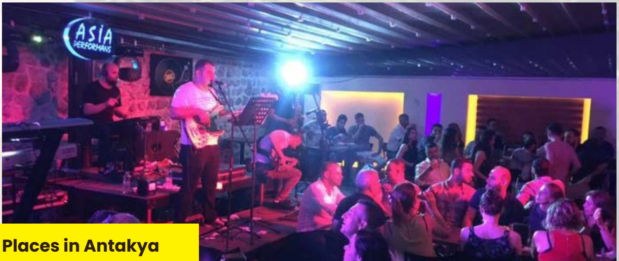
Places in Antakya

Long Bazaar is located just at the heart of the city and offers wide variety of local and traditional products. This historical bazaar is the place where locals live daily life. Also many famous local and traditional restaurants located at the narrow streets of this place.