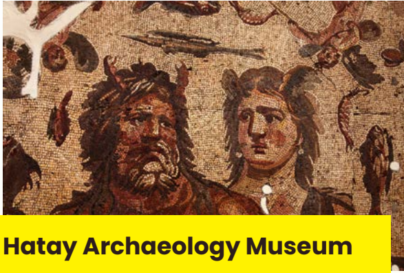
Hatay Archaeology Museum

Hatay Archaeology Museum is home to an extensive mosaic collection of Roman and Byzantine periods. There are marvelous depictions of nature and human life in various forms from different periods.