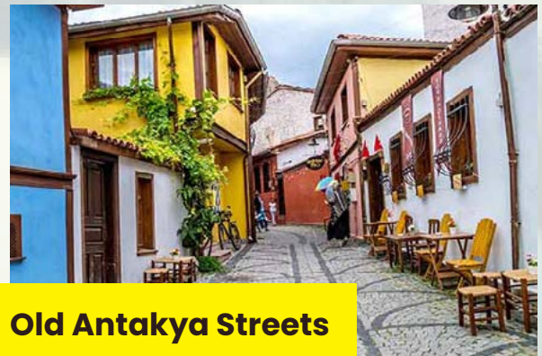
Old Antakya Streets

Habib Neccar Mosque built in the 7th century and known as the first mosque in Anatolia. The mosque has great importance to Muslims all over the world as well as to the Christians due to Habib Neccar's religious acceptance.