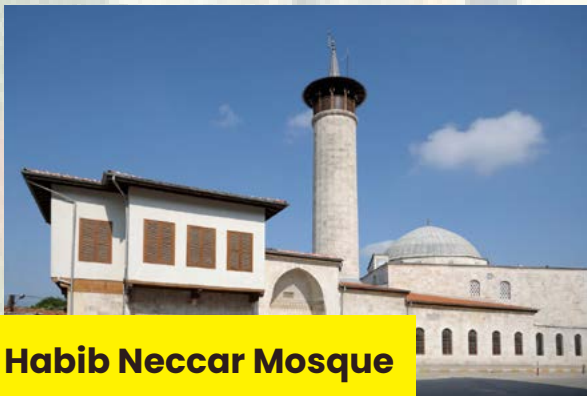
Habib Neccar Mosque

Church of Saint Peter is one the first churches of Christianity and some argue that the church was used by the first Christians. The church used to be hidden in a cave because during its first years Christian were had to worship in secrecy.